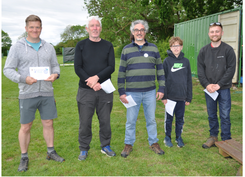
Participants with their certificates after completing the beginners course