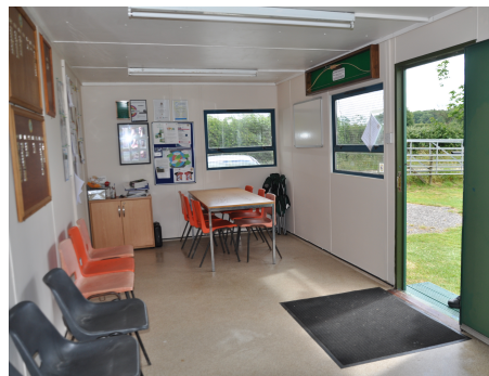
Nice clean walls and floor!