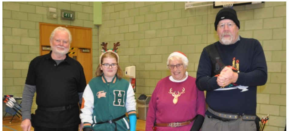
The Christmas Allsorts

Very well done to the Allsorts for winning!