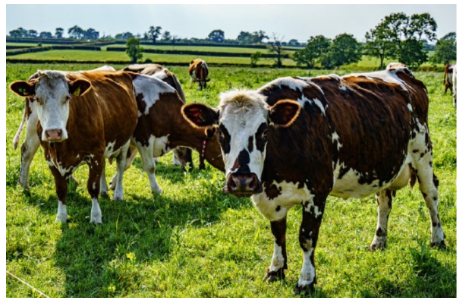
Very curious ladies - perhaps they want to learn about archery!