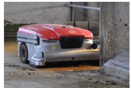
Right: Robot cleaning the slurry.