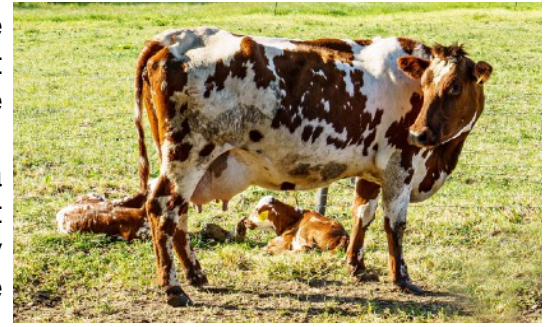
Mother and babies enjoying the sunshine

While Marcus was finding some cows to show us the milking machine in action we headed back to the milking area.