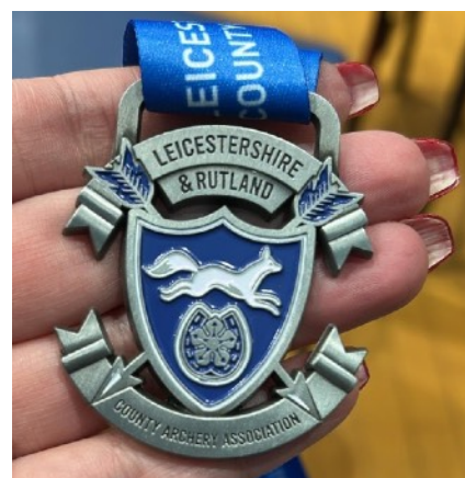
One of the medals

Well done and congratulations to everyone who took part, a great team effort