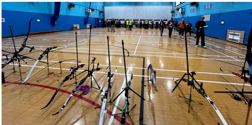
So far to shoot those arrows

Only two of our team had ever shot at a formal external competition before, and it was certainly challenging, as it was very disciplined, with shooting in double details with double scoring, and against the computer display timing clock with just two minutes to shoot each 3-arrow end - just like you see at the Olympics.