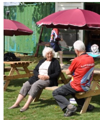
Picnic table being well used