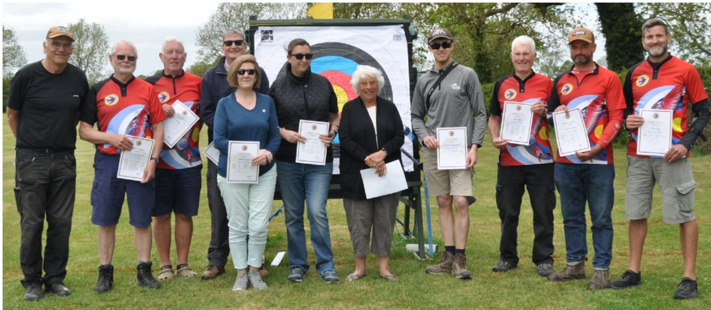
above: Certificate winners