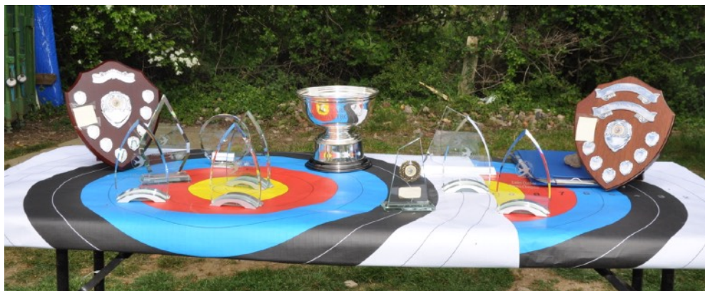
Trophies and shields set out ready to present