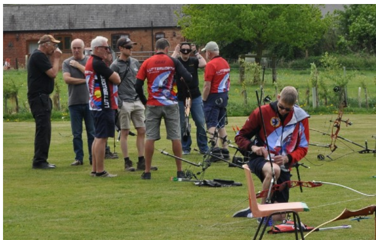
Bows all set and ready for a Warwick shoot