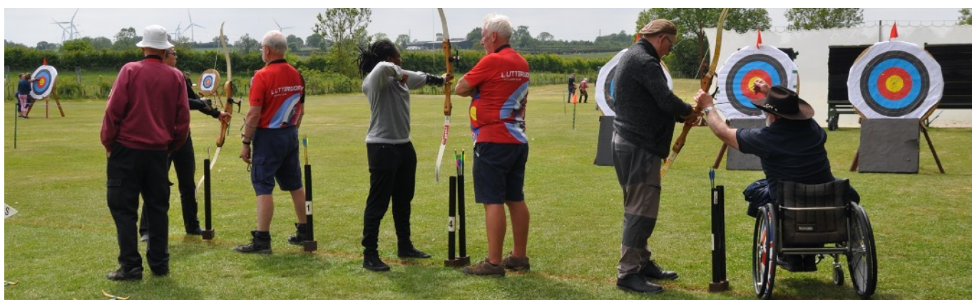
Getting to grips with the bows