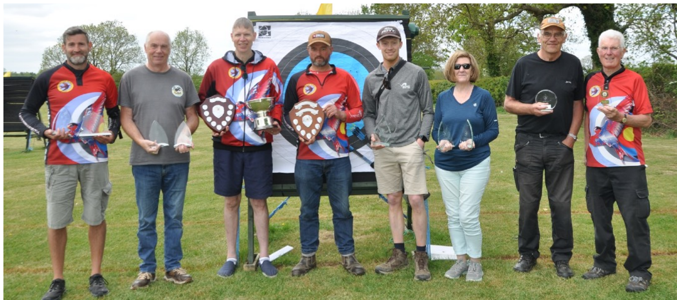
above: Trophy/Award winners