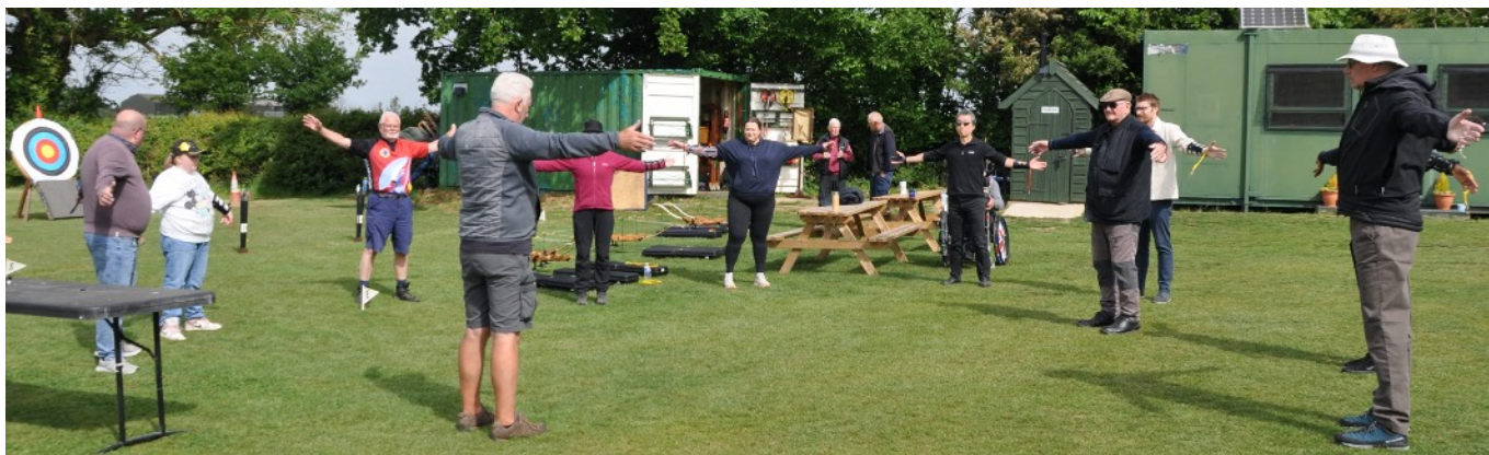
Warming up exercises

Our next beginners' course is in August, and our coaches and helpers look forward to an intense but enjoyable weekend of archery with another enthusiastic group.