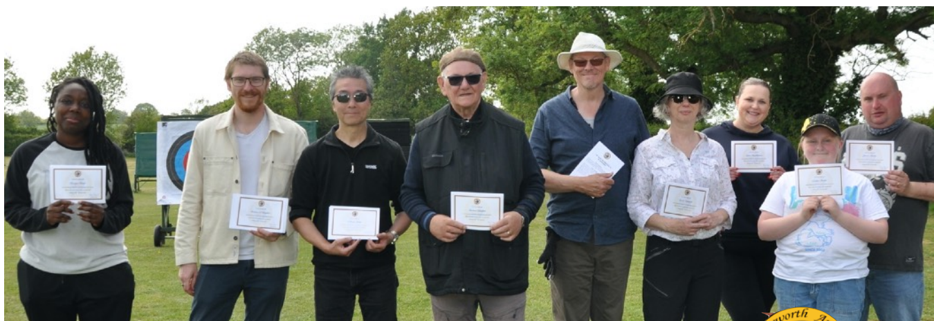
9 participants all smiles with their certificates