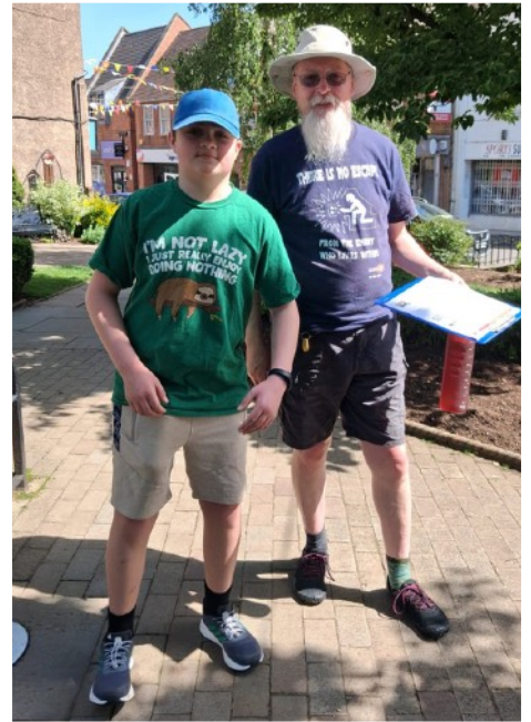
Clipboard at the ready!