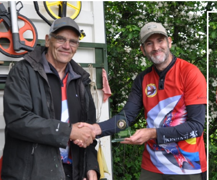
Cliff - Gents compound trophy