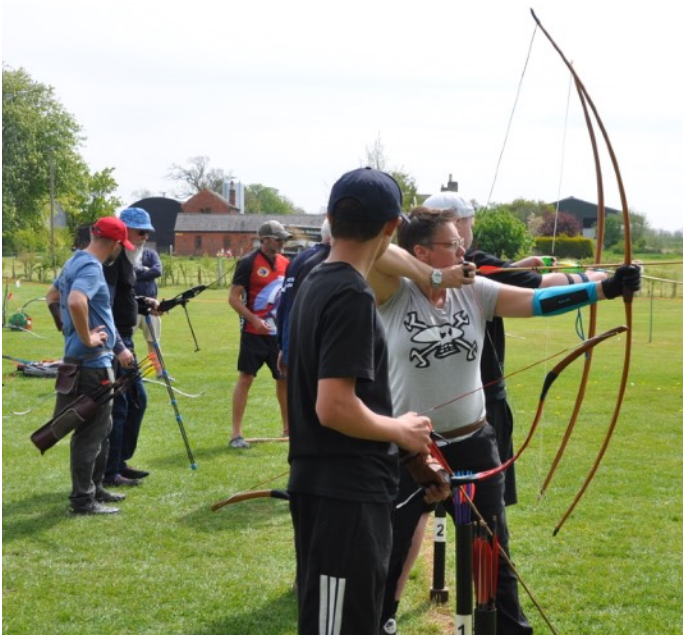
On the shooting line