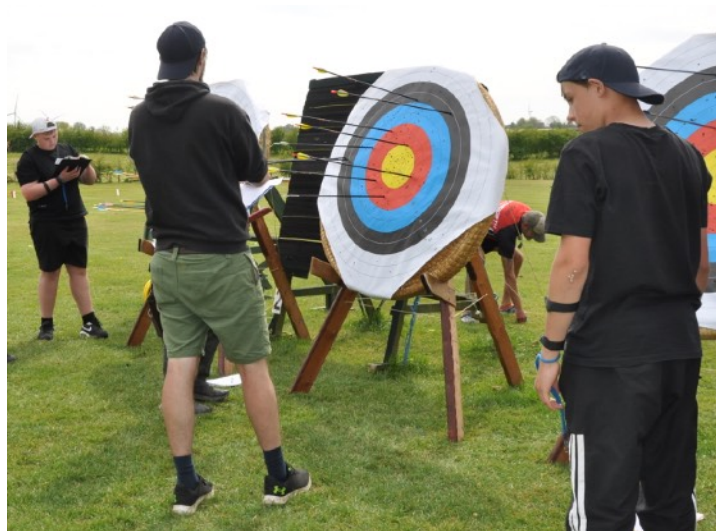
Learning the art of scoring