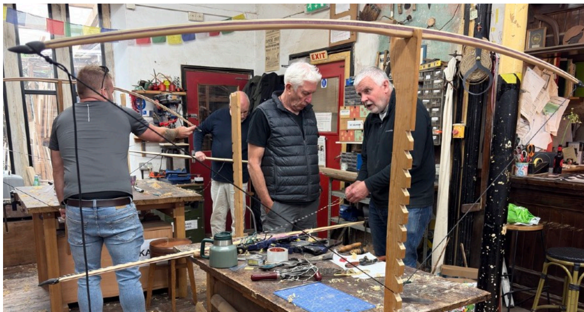
The partly formed bows have been carefully shaped with spokeshaves and scrapers, and are now on a tiller jig for making the perfect curves.

We completed our strings, carved string grooves in the nocks and finally tried a full draw with our new longbows. - No creaks, cracks or splinters. Phew!