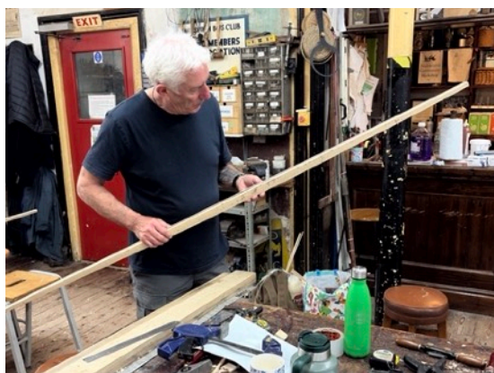
An embryo bow - the three pieces of wood glued together and ready to be carved into a bow.

We selected our three pieces of laminate, hickory, lemonwood and purple heart all imported from North and South America and each selected for its compression and tension characteristics and qualities. We worked in pairs glueing the laminates together and then tightly wrapping the sandwich with tape to form what did have the shape of a bow but felt more plank like. The bows were stacked one on top of the other, forced down onto a humpback bridge shaped form and secured at each end. An oil-fired tube radiator lying inside the tent like structure completed that night's preparation for the next stage.