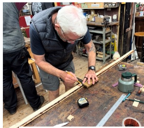
Marking up the glued woods with the design of the bow length and weight each person wants to end up with.

The bows continued to take shape, and we started to tiller our bows understanding how the whole limb works as one both sides of the handle.