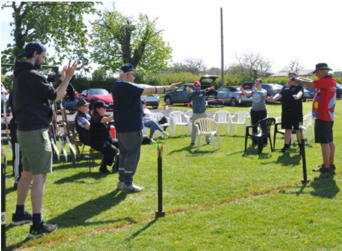
Warming up ready for action

A few photos of the course from over the weekend