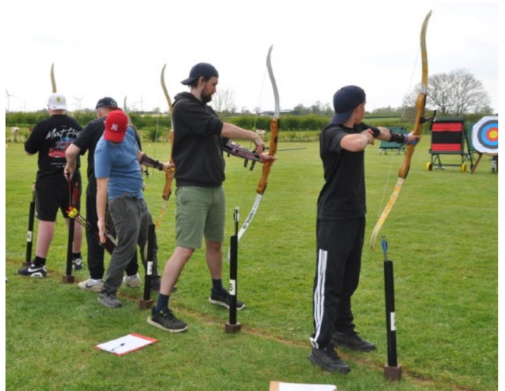
Clipboards at the ready