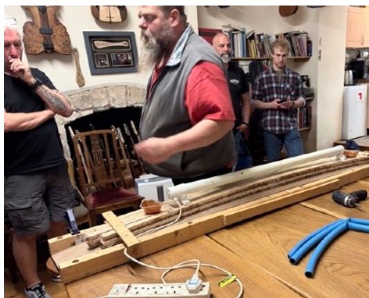
We have glued our three pieces of wood together, and they go into a heated jig

We selected our three pieces of laminate, hickory, lemonwood and purple heart all imported from North and South America and each selected for its compression and tension characteristics and qualities. We worked in pairs glueing the laminates together and then tightly wrapping the sandwich with tape to form what did have the shape of a bow but felt more plank like. The bows were stacked one on top of the other, forced down onto a humpback bridge shaped form and secured at each end. An oil-fired tube radiator lying inside the tent like structure completed that night's preparation for the next stage.