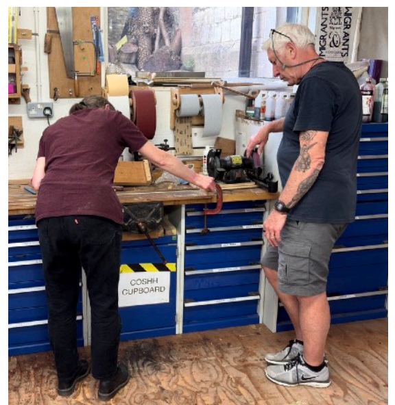
We made our own bow strings too, from B55 Dacron in Flemish 3-twist lay

No doubt you will see our bows at the field, please come and have a look!